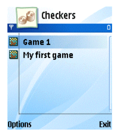
Game list view