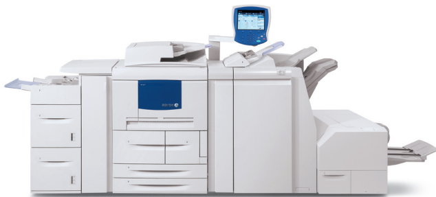
Xerox 4112/4127 Copier/Printer

Note: The Xerox SquareFold Trimmer Module requires the Booklet Maker Finisher and can be used with any of the print servers for the Xerox 4112/4127 Family.