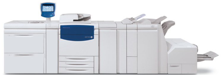
Xerox 700 Digital Color Press

Note: The Xerox SquareFold Trimmer Module requires the Booklet Maker Finisher and can be used with any of the print servers for the Xerox 4112/4127 Family.