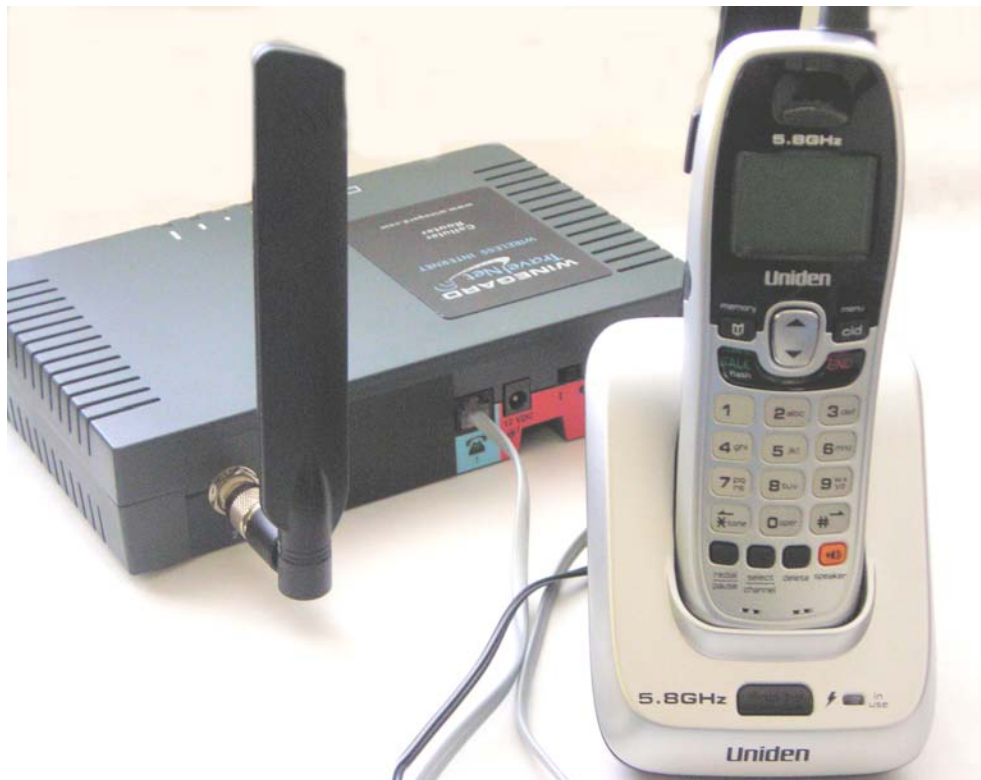
Figure 2 (phone not included)