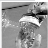
Step 5. Remove the rubber purple insert