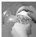
Step 6. Twist off the white housing

Be careful not to dislodge the purple rubber plugs within the white housing.