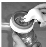
Step 4. Lift the handle and remove