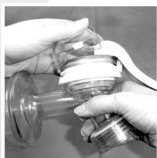
Step 3. Remove the clear dome