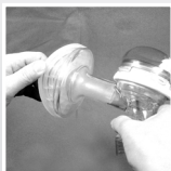
Step 2. Remove honeycomb