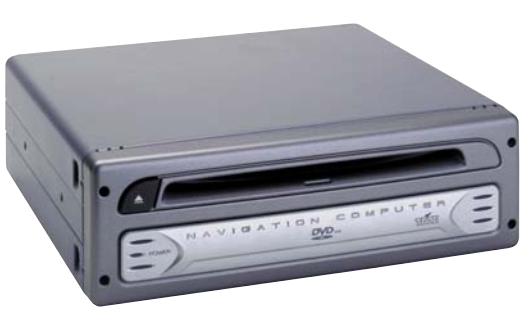
*Mounting sleeve not included