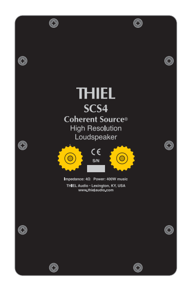
Rear input panel

The speakers should be connected to the amplifier with high quality cable to ensure minimal loss of power and proper control by the amplifier. If the speakers are being connected to a vacuum tube amplifier with various impedance taps, the 4 ohm tap will usually give the best results.