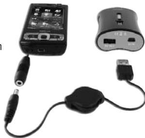
Charging a device using its USB cable.

NOTE: If none of the included adapters fits snugly into your portable device power jack, please go to our web site at www.tekkeon.com/mp1800adapters to determine which adapter plug you need for your device. You can obtain most adapters through the web site, or by contacting Tekkeon by phone at: 1-888-787-5888 or 1-714-832-1266 . If available through Tekkeon, the adapter will be sent to you for a nominal fee.