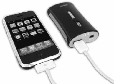
Charging a device using its USB cable.

NOTE: You can use the emergency flashlight while charging your device.