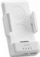
myTune FM with mounting clip