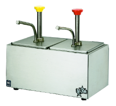
Model CD2P-DM Condiment Dispenser

Star's Condiment Dispensers are covered by Star's one year parts and labor warranty.