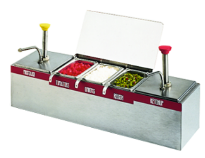
Model CD2P-3 Condiment Dispenser