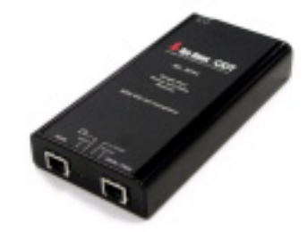
BL-8551HW Single Port