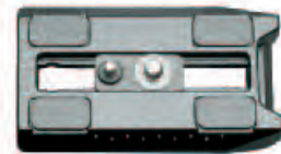
6179 DW-PKS03 Quick-release plate for DST-3