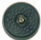
6124 618-335 Quick-release for PRO 700 DX and BH 800 (1/4-20)