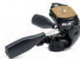
ABLE 300 DX HEAD 615-330 3-way Pan Head with quick-release plate Height: 4.10 in. Weight: 1.42 lbs. Max.Operating Load: 13.00 lbs.