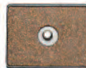
6183 BK 618-740 Quick-release plate for the SPRINT PRO 3-Way, PRO 614 DX, SH-704E, and AF-1100E, SH-707E, SPRINT PRO EZ