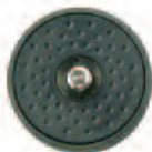
6125 618-340 Quick-release for PRO 700 DX and BH 800 (3/8)