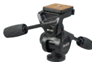
SH-807E 618-807 Precision 3-way Pan Head with 3 bubble levels, 1 for each axis Height: 5.86 in. Weight: 2.14 lbs. Max.Operating Load: 22.00 lbs.