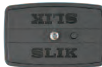
6222 618-738 Quick-release plate for F740, F630, F163, F153, F143