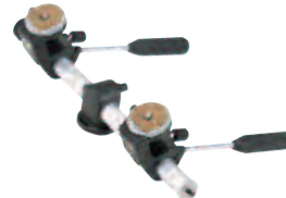
TWIN PAN CAMERA PLATFORM