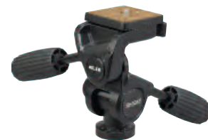
SH-806E 618-806 Precision 3-way Pan Head with 3 bubble levels, 1 for each axis Height: 5.27 in. Weight: 1.52 lbs. Max.Operating Load: 15.00 lbs.