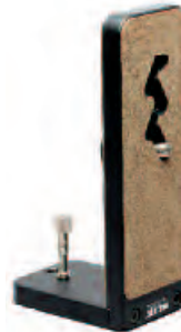
VERTICAL CAMERA BRACKET-L

Mount 2 cameras side-by-side on one tripod head