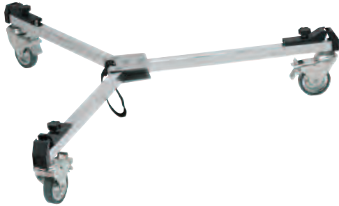
DOLLY II 617-702

SLIK offers a selection of short columns for low angle photography as well as extra and replacement quick-release shoes for SLIK tripods. Please visit our web site at www.thkphoto.com for a full list of accessories.