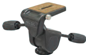
SH-909 618-909 Heavy Duty 3-Way Pan Head with smooth precise movements Height: 5.71 in. Weight: 3.75 lbs. Max.Operating Load: 26.00 lbs.