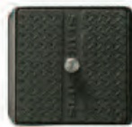
6256 618-716 Quick-release plate for SH 736 HD