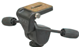
SH-908 618-908 Heavy Duty 3-Way Pan Head with smooth precise movements Height: 5.31 in. Weight: 3.00 lbs. Max.Operating Load: 22.00 lbs.