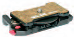
DQ-L QUICK-RELEASE ADAPTER 618-711

Magnesium alloy quick-release system for larger cameras