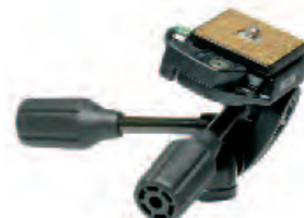
SH-704E 618-640 3-way Pan Head with quick-release plate Height: 2.95 in. Weight: 0.64 lbs. Max.Operating Load: 7.00 lbs. Recommended tripods: PRO 713 CF-II, PRO 613 CF, PRO 614 CF