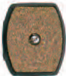
6123 618-330 Quick-release for Able 300 DX, PRO 330 DX, PRO 340 DX, PRO 400 DX, SH-705E