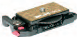
DQ-S QUICK-RELEASE ADAPTER 618-713

Large Magnesium quick-release plate for DQ-L