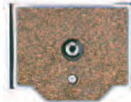
6011 618-730 Quick-release plate for 505QF, 506QF