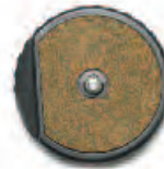
6019 618-734 Quick-release plate for AF2100