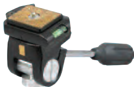
SH-707E 618-717 E-Z Multi-action pan head with single handle for multi-movement control Height: 3.35 in. Weight: 1.00 lbs. Max.Operating Load: 8.80 lbs.

Recommended tripods: PRO 400 DX, PRO 330/340 DX, PRO 813/814 CF-II, PRO 713/714 CF-II, PRO 613/614 CF, SPRINT PRO