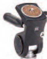
MASTER CLASSIC PAN HEAD 619-710 Professional 2-Way pan head with single handle for multi-movement control. Perfect for tracking moving subjects with telephoto lenses Height: 5.10 in. Weight: 1.54 lbs. Max.Operating Load: 13.25 lbs.

Recommended tripods: PRO 400 DX, PRO 330/340 DX, PRO 813/814 CF-II, PRO 713/714 CF-II, PRO 613/614 CF, SPRINT PRO