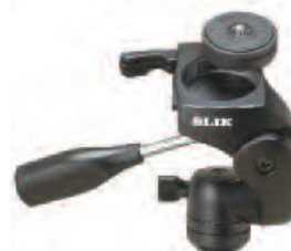
PRO 700 DX HEAD 615-700 3-way Pan Head with quick-release plate Height: 4.72 in. Weight: 2.20 lbs. Max.Operating Load: 18.00 lbs.