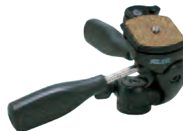
SH-705E 615-335 3-way Pan Head with quick-release plate Height: 3.75 in. Weight: 1.12 lbs. Max.Operating Load: 11.00 lbs. Recommended tripods: PRO 713 CF-II, PRO 813 CF-II, PRO 814 CF-II, PRO 500 DX, PRO 330 DX, PRO 430 DX

Recommended tripods: MASTER CLASSIC, PRO 500 DX, PRO 400 DX, PRO 883 CF-D, PRO 813-814 CF-II, PRO 731-714 CF-II