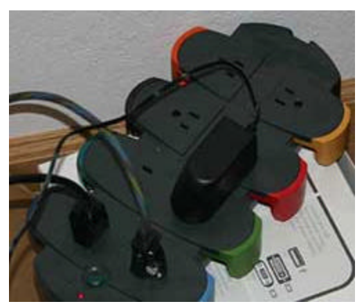
The power plug blocking another outlet even on my oversize outlets

The other issue I had with the design of the drive was the power plug. The AC plug on the power adapter had a very unusual shape. The plug was designed such that the wire goes to the side of the plug instead of dropping down (see picture below). The only situation I believe this design accommodates is plugging it into the top outlet of a wall jack. However, I think it is far more typical for most home computer users to use surge protected power strips for computer devices, and on a power strip, the plugs are typically aligned such that the prongs are all parallel. All 5 of my power strips are designed in that fashion. That means that the SimpleDrive plug not only covers more than one outline (even on the oversized outlets), but the wire goes off to the side, interfering with anything to the left of it. The work around is to simply plug it into the outlet at the far end of the power strip, which is not a big deal in this case, since this is the only power plug I have that is designed like this.