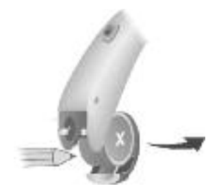
Fig. 3: Removing batteries