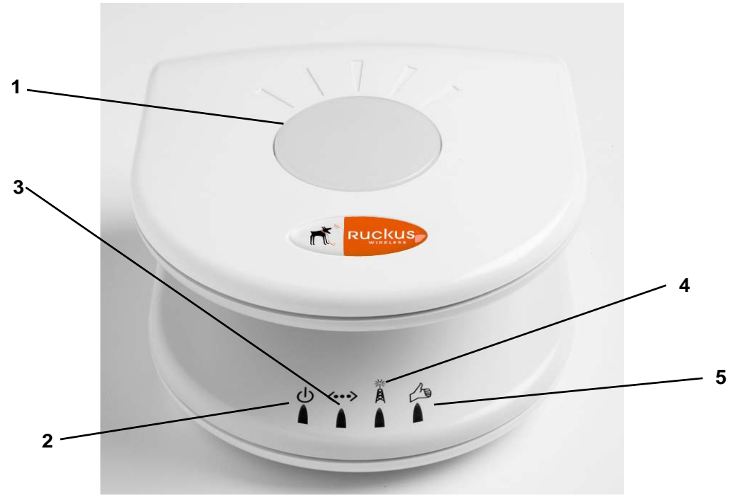
Figure 2—Front View of the MediaFlex 2501 Multimedia Wireless Adapter

Figure 2— "Front View of the MediaFlex 2501 Multimedia Wireless Adapter" shows the front view MF2501 Adapter, with the LED indicators numbered. The numbers correspond to the labels describing LED behavior in Table 2— "LED Indicators and Meanings" on page 13.