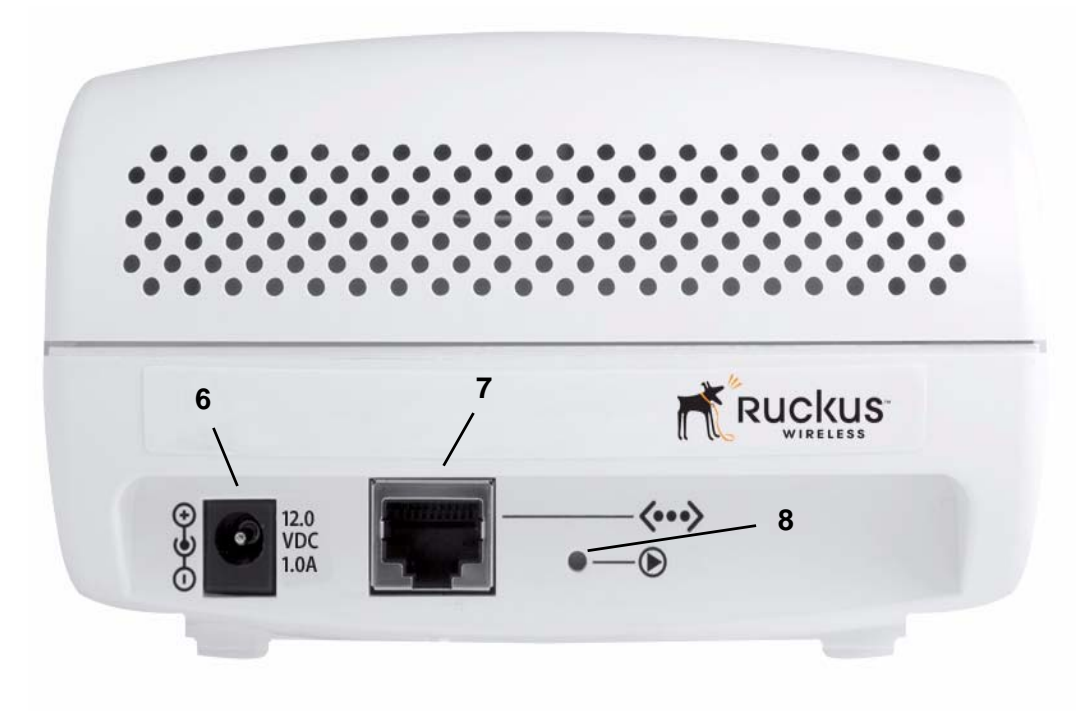
Figure 3—Rear View of the MF2501 Adapter