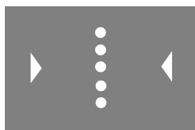
Strong Signal Accurately Tuned