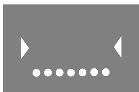
No Signal Very Weak & Noisy

For an FM station to provide good fidelity its signal must be strong enough to trigger the tuner's tuning and noise limiting circuits. The tuner must also lock precisely on to the centre of the broadcast signal. The Signal Display Unit on your Caspian tuner displays both Signal Strength and Centre Tuning.