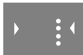
Fairly Strong Signal Tuned Off Centre

When manually tuning a station, the centre figure of the above display is the one to aim for.