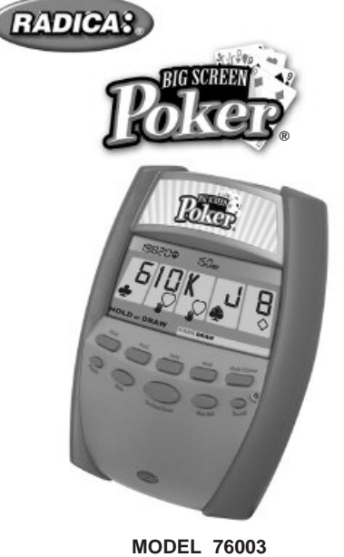
For 1 Player / Ages 8 and up INSTRUCTION MANUAL