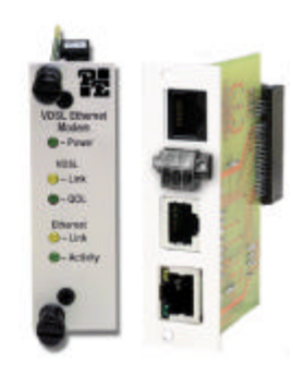
Model 1058DV and 1058DVRC