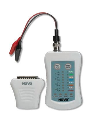
Allport Tester Troubleshoot the inevitable with the CAT5 and Allport tester that detects and pinpoints the location of errors.