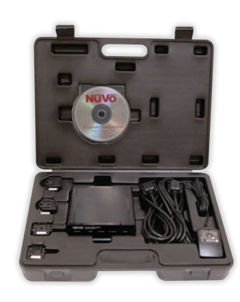
Learning Station The Learning Station provides an easy one-step system for learning, testing, and loading IR codes into the Nuvo Configurator software. Compatible with the Essentia, and Concerto systems.