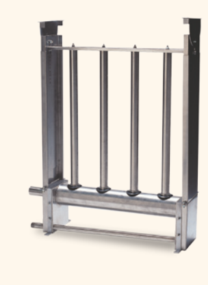
SAM-e Short Absorption Manifold