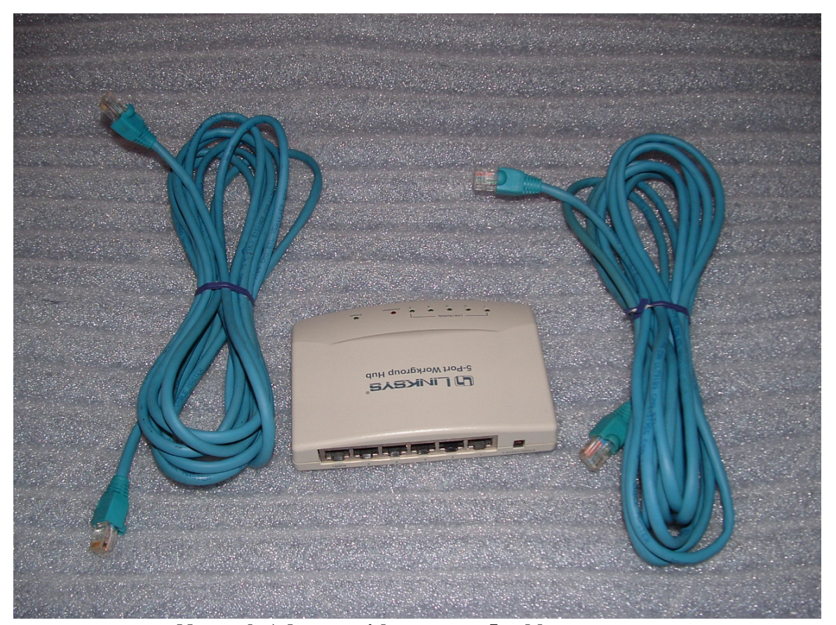
Network Adapter with category 5 cables

The picture above shows an example of a 5 port hub. One computer and up to 4 scales can be connected for programming.