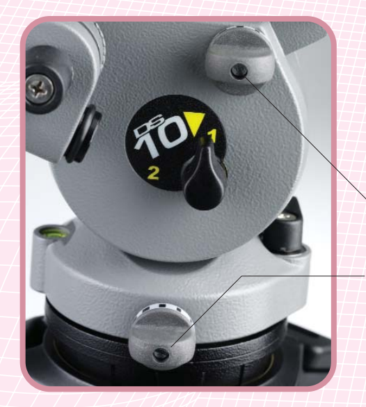
Fig 4 Drag control knobs

Note: The fluid drag plate system has been designed to suit most operating conditions. The friction drag adjustment should only be utilised when extra resistance is required.