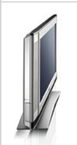
TABLE BASE curved or straight metallic silver

curved: Dimensions: w66,0 x h7,1 x d20,0 cm Weight: 2,5 kg