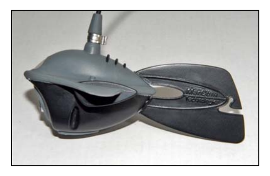
Figure 2: Camera with Down-viewing Fin

To charge the battery, remove the negative and positive power leads attached to the battery. Attach the power leads with alligator clips to the appropriate battery posts. If the battery is completely dead it may take up