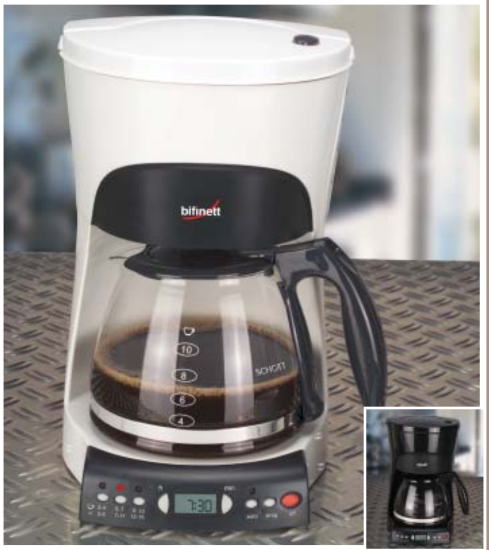
Coffee machine with timer KH 1