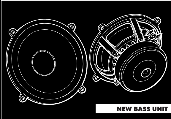
NEW BASS UNIT