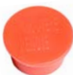
Red Plastic Cap

Small Washer (2) Large Washer (4) Spring Washer (2) Snap Pin (2) Hub Cap (2)