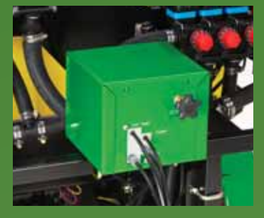
OPTIONAL FOAM MARKER Combined air and liquid lines to foamer head ensures round and accurate droplets. No tools needed to adjust rate—just turn easy-to-reach valve.

BREAKAWAY BOOMS Spray around trees with confidence. Standard bi-directional breakaway protects boom if object is struck while moving forward or backward.