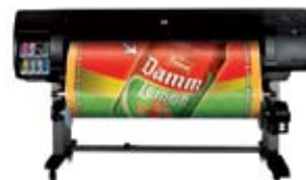
HP Designjet Z6100