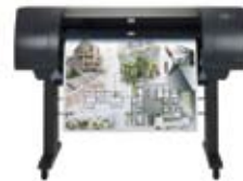
HP Designjet 4000/4020