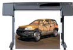
HP Designjet 800