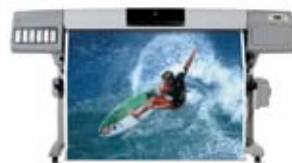
HP Designjet 5000/5500 HP Designjet 5100 (AP only)