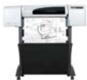
HP Designjet 500/510 HP Designjet 500 Mono (AP only)