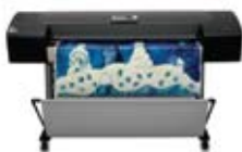
HP Designjet Z3100/Z3200