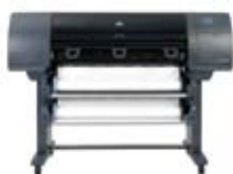
HP Designjet 4500/4520