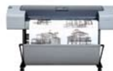
HP Designjet T610