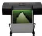
HP Designjet Z2100