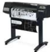
HP Designjet 1000/1055