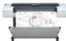
HP Designjet T1100/T1120