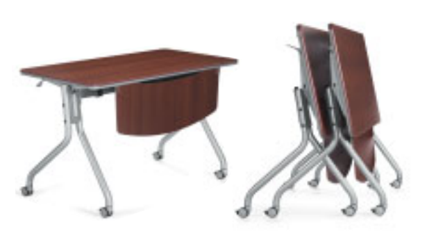
An easy-to-release mechanism allows the table top to be flipped and "nested" together to save space when not in use.