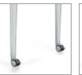
Tapered with Casters Tapered legs for a functional appeal. Glides are adjustable.

Legs are available in two styles -Tapered and Spider and in two finishes in Silver (SI) or Black (BK). Choose from adjustable glides or locking casters.