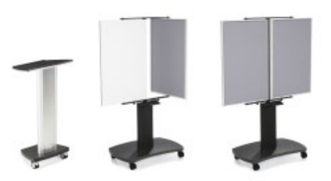
A Lectern enhances speaker attention. Presentation Boards can serve as a single or two-piece / two-sided rotating white board. Fabric tackboards available (All optional).