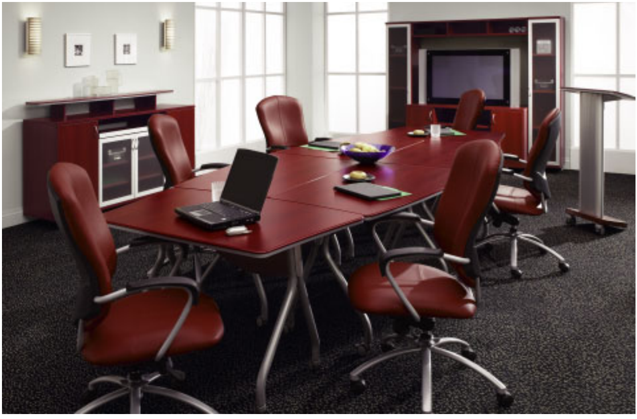
Tables shown in Avant Cherry (AWC) with Silver Spider legs (SI) and trim. Credenza Buffet shown in Avant Cherry.