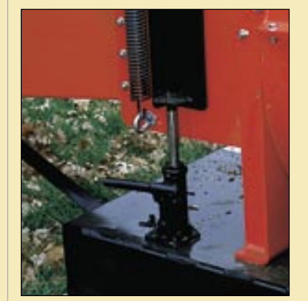
Built-in hydraulic jack makes feed roller maintenance quick and easy.