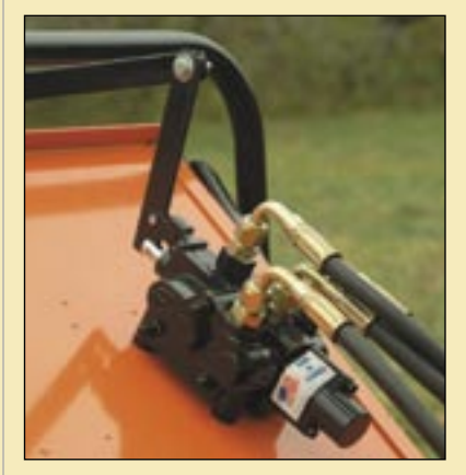
A four-position manual valve easily controls the hydraulic feed roller.