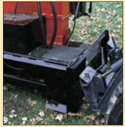
The chipper has two mounts, so it can be set to feed in front or to the curb side.