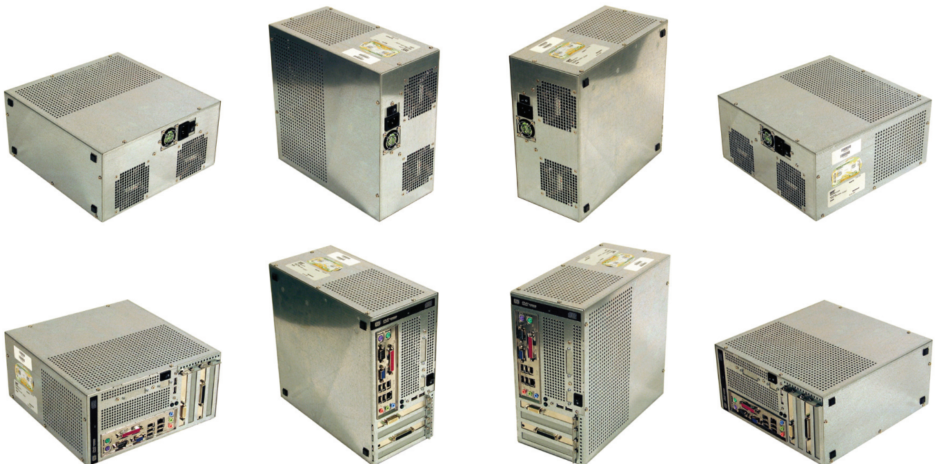
All pictures are for illustration only. The I/O port arrangement, motherboard and add-in boards will differ depending on the configuration.