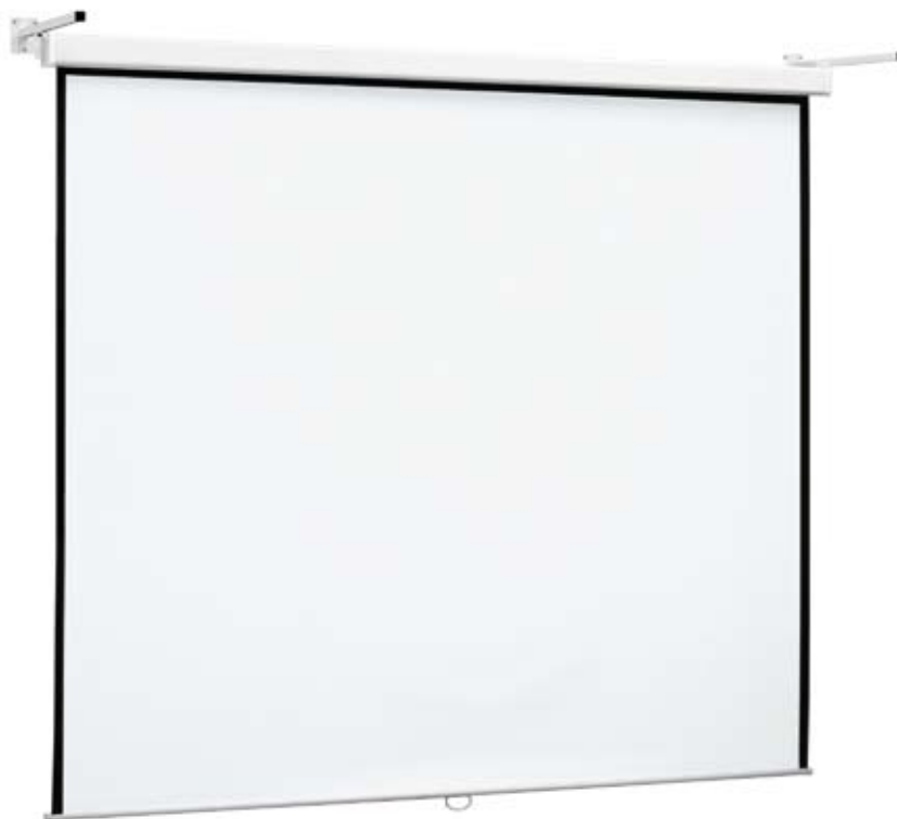
Series 500 Large Format Manual Wall Screens