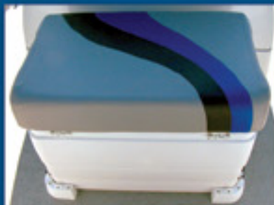
Ice Chest in Front of Console