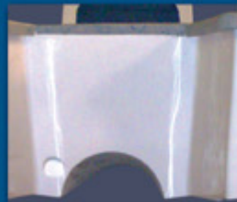
Tunnel Design on Hull