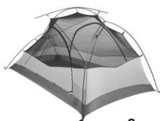
Copper Spur UL2

----- Cut here to remove. Do Not Tear! -----