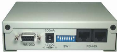
Figure 2: Regcom Rear Panel

The Hydra uses a bi-directional 2-wire RS-485 data bus to communicate to the slave devices. The device at each end of the network must be terminated. An 8-DIP switch on the rear of the unit is used to set the termination. Switch No. 8 is the terminal switch. When set to ON, the device is terminated. When set to OFF, it will be un-terminated.