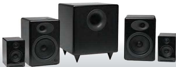
Audioengine S8 with A5 and A2