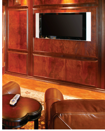
Boardrooms generally require the 1365, while the 9A60 is more suited to home use.