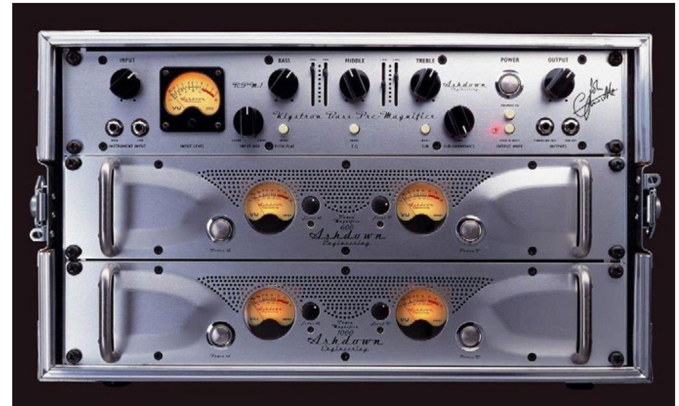
JE-RPM-1 & APM-1000's

For More Info go to www.ashdownmusic.com or email info@ashdownmusic.co.uk