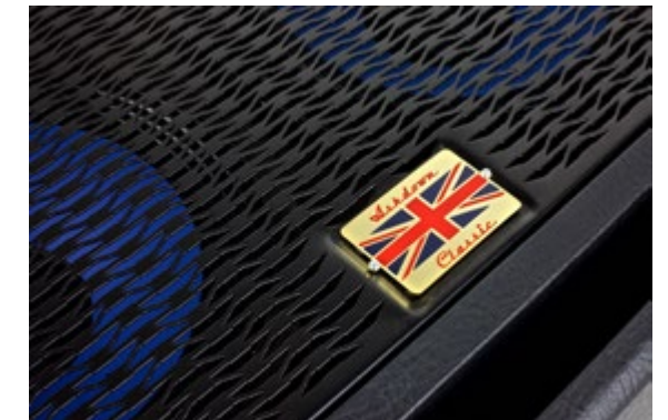
Foundation UK Back Plate