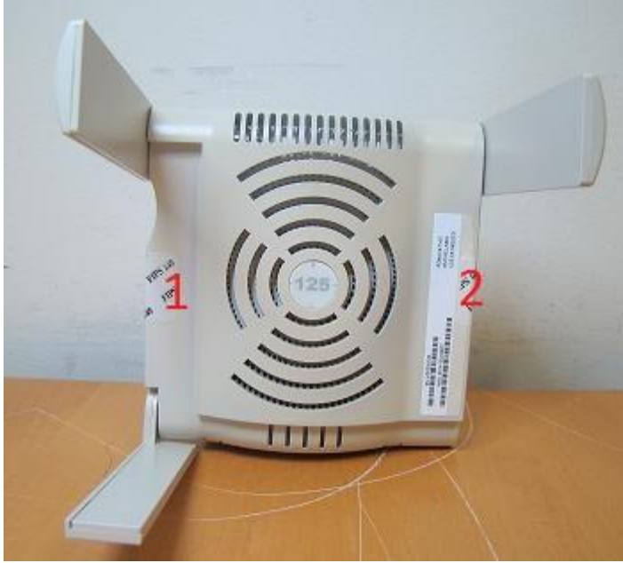
Figure 12: AP-125 Bottom view