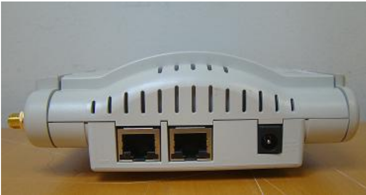
Figure 1: AP-124 Front view

Following is the TEL placement for the Aruba AP-124: