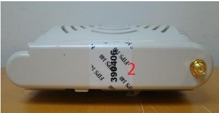
Figure 5: AP-124 Top view