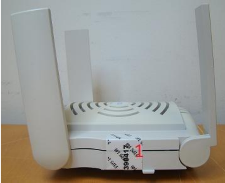
Figure 10: AP-125 Right view