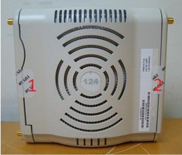
Figure 6: AP-124 Bottom view