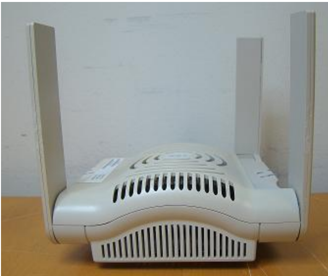
Figure 9: AP-125 Left view