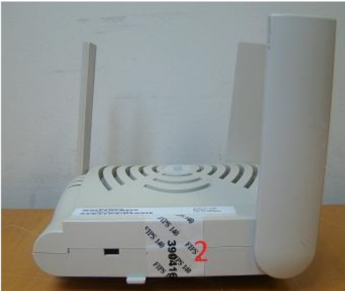
Figure 11: AP-125 Top view