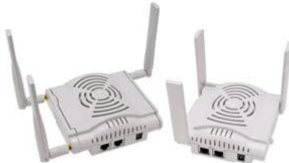
Figure 1 – Aruba AP-120 Series Wireless Access Points

The Aruba AP-124 and AP -125 are high-performance 802.11n (3x3) MIMO, dual-radio (concurrent 802.11a/n + b/g/n) indoor wireless access points capable of delivering combined wireless data rates of up to 600Mbps. These multi-function access points provide wireless LAN access, air monitoring, and wireless intrusion detection and prevention over the 2.4-2.5GHz and 5GHz RF spectrum. The access points work in conjunction with Aruba Mobility Controllers to deliver high-speed, secure user-centric network services in education, enterprise, finance, government, healthcare, and retail applications.