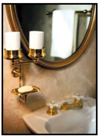
In the bathroom . . .