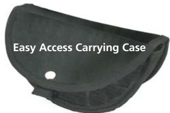
Easy Access Carrying Case

Interchangeable Lenses for Different Tasks and Weather Clear • Amber • Bronze